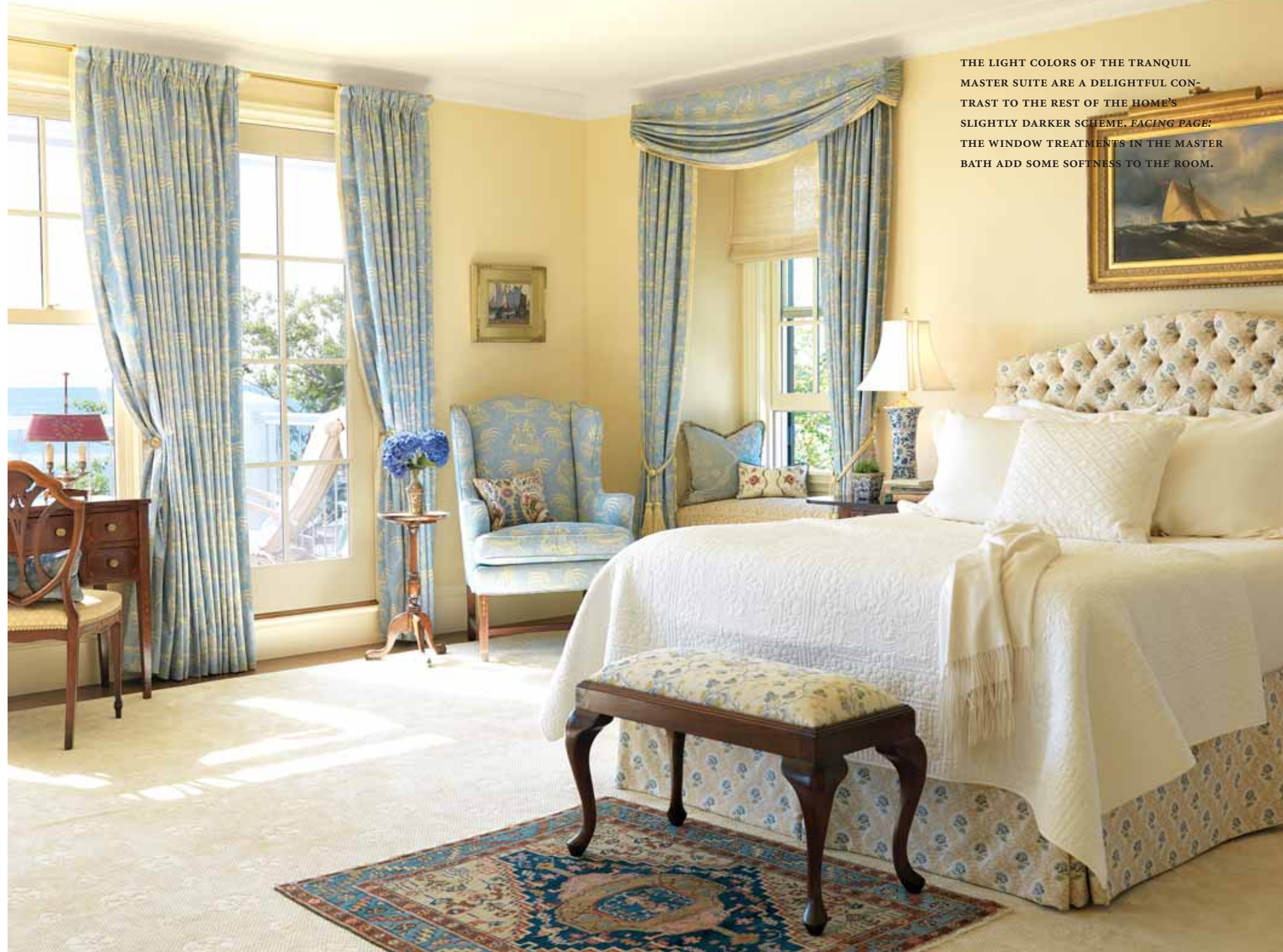
THE LIGHT COLORS OF THE TRANQUIL MASTER SUITE ARE A DELIGHTFUL CONTRAST TO THE REST OF THE HOME'S SLIGHTLY DARKER SCHEME. FACING PAGE: THE WINDOW TREATMENTS IN THE MASTER BATH ADD SOME SOFTNESS TO THE ROOM.

great partnership because they stretched me in some ways and I think I pulled them in others. It was definitely a give and take, and I think we got the best of all of us.”